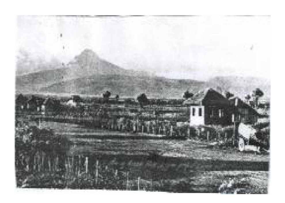
Fig. 5. A settler's house with Mt. Matutum at the background

At 4:00 a.m. the following day the general to start the day's work awakened everybody. Life in the pioneering region had begun . . .